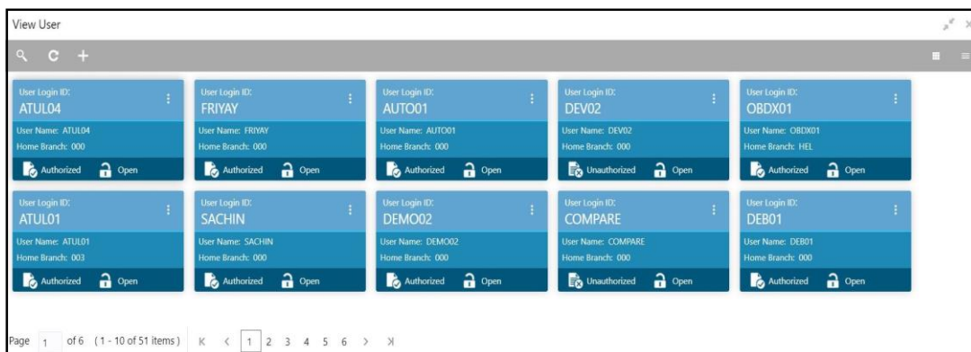
Figure 1.3: View User

For more information on menus, refer to Table 1.3: View User - Field Description .